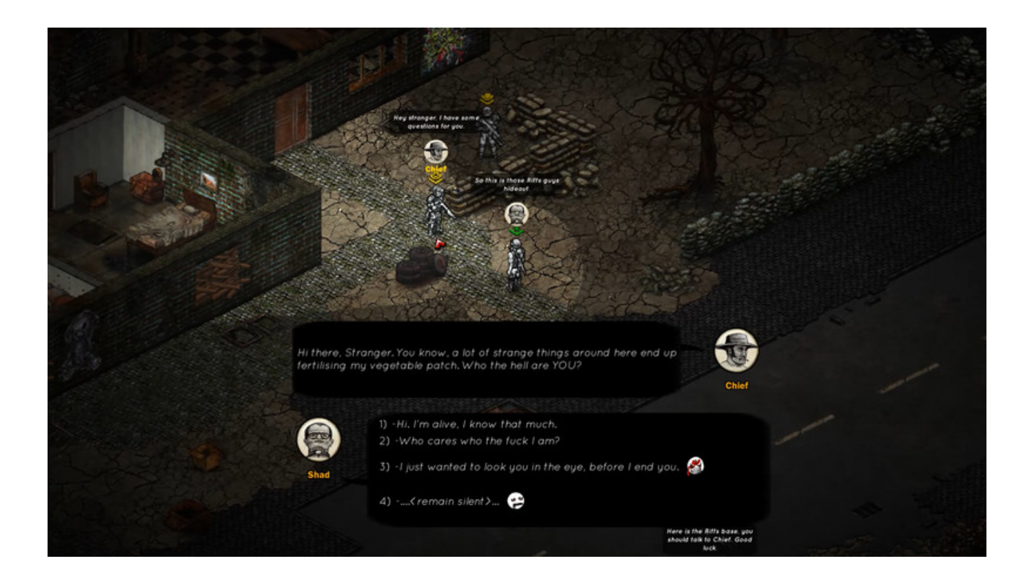
Fasaria World: Ancients Of Moons Activation Code [Xforce Keygen]

Download >>> <a href="http://bit.ly/2NJ0pJr">http://bit.ly/2NJ0pJr</a>