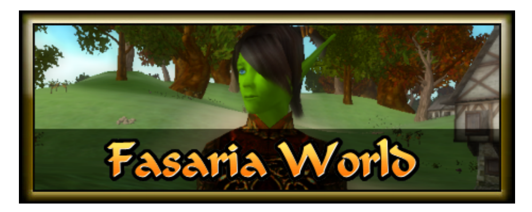
What is Fasaria World: Ancients of Moons MMORPG?

Fasaria World: Ancients of Moons is a single/multiplayer fantasy online experience that can be played locally from your PC (single player offline). Instructions are included on how to host your own server and how other players can join your game. Fasaria World was originally released in 2005 and then re-produced and re-released in 2012. The game was eventually taken